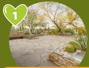
OTTOSEN ENTRY GARDEN TERRACE

The raised terrace nestled in Ottosen Entry Garden is enclosed with stone planters of cactus and succulents and often shaded by a canopy of desert trees