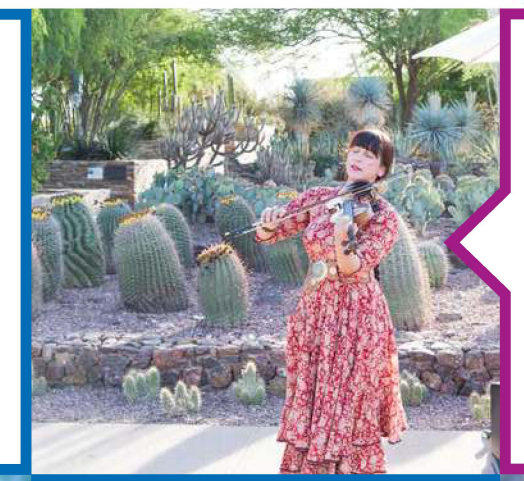
Backstage Dinner $3,000 1 secured / 0 AVAILABLE

Featuring Chihuly in the Desert. The Cocktail Reception Host will be recognized on bar signage, and included in the event program and event signage.