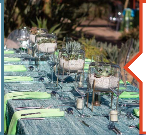
Backstage Dinner $3,000 1 secured / 0 AVAILABLE

The Entertainment Host will be recognized on the menu card and signage at the performance area.