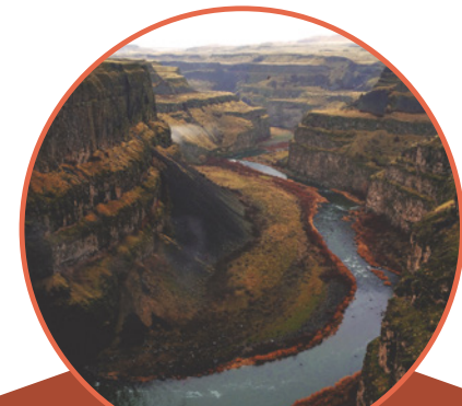
TRAVEL & ADVENTURE