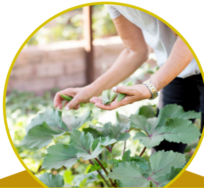
LANDSCAPE & GARDENING