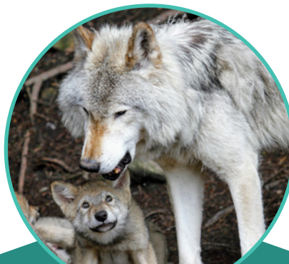
HISTORY & SCIENCE