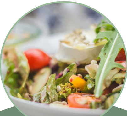
COOKING & WELLNESS