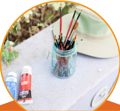
ART & PHOTOGRAPHY

At Desert Botanical Garden, learning knows no bounds. Our education offerings go beyond the boundaries of the classroom to create enlightening opportunities to build connections with nature. Whether it covers gardening or cooking, the Garden's classes take nature experiences into hands-on practice. Take a peek at some of the types of classes, workshops and excursions the Garden is offering.