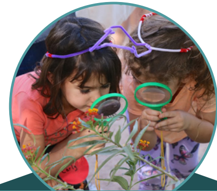
CHILDREN & FAMILY