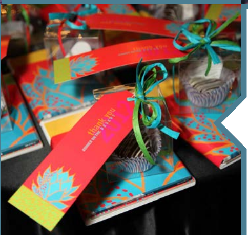
Parting Gifts $2,500 1 SECURED / 0 AVAILABLE

The Dinner Wine Host will be recognized on signage at bars and on a personalized pin worn by servers.